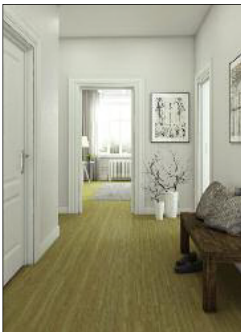
Forbo's Marmoleum Click Cinch Loc features antimicrobial properties that halt the breeding of harmful microorganisms.

Creating beautiful, custom floors is easy and fun with Marmoleum Click Cinch Loc. This naturally healthy, water-resistant flooring is made primarily from renewable resources, including linseed oil, wood flour and pine rosins. These natural ingredients provide Marmoleum Click Cinch Loc with inherent anti-static properties to repel dust and dirt, making it easy to clean, reducing exposure to allergens and contributing to better indoor air quality. The flooring clicks together for an easy, glue-free installation. These features make Marmoleum Click Cinch Loc an ideal floor covering for people with asthma and allergies. Marmoleum Click Cinch Loc also features antimicrobial properties that halt the breeding of harmful microorganisms, including MRSA and C. difficile.