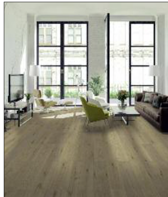
Sono uses proprietary, high-definition printing technology to achieve realism.

health of your family—and the one place you should feel safest is at home—Sono floors are 100% free of